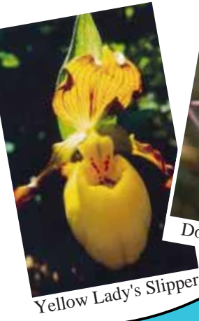
Yellow Lady's Slipper