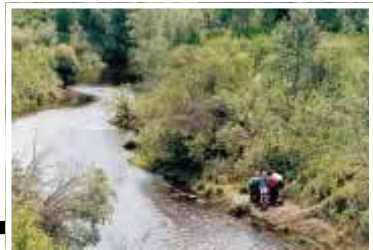
Exploring Beaver Creek

Beaver Creek Conservation Area is open seasonally throughout the year. Family and friends can experience the sights and the sounds of Beaver Creek along a selection of five nature trails.