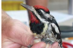
Yellow-bellied Sapsucker

This summer, Beaver Creek Conservation Area completed its second year as a member of a bird banding program with The Institute for Bird Populations in California called Monitoring Avian Productivity and Survivorship (MAPS). Beaver Creek is one of over 500 participating members throughout Canada, Mexico and the continental U.S. There are two participating stations in Saskatchewan. MAPS stations work together to monitor landbirds during the breeding season to aid the conservation of our feathered friends in North America.