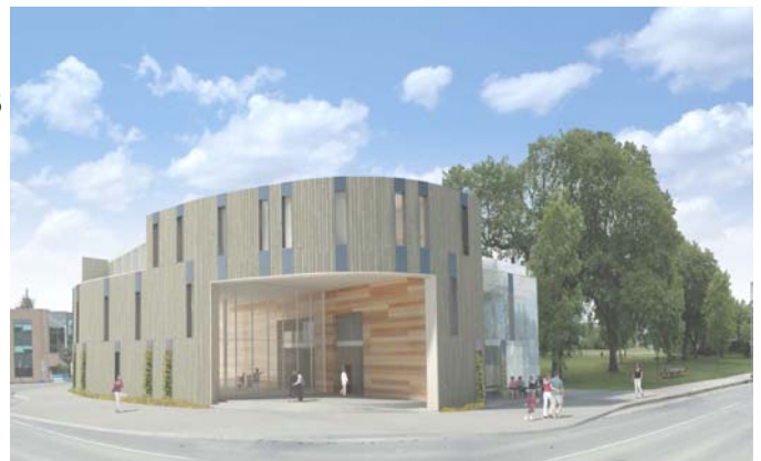
Moriyama & Teshima Architects March Schaffel Architects in Association

We have always known that Meewasin returns 20 cents on the dollar for Saskatoon and area. Of the $90 million Meewasin has spent in the valley in the last 29 years $18 has come from the local taxpayer. The rest has been leveraged through grants and fund development programs. We also know that every tourist we keep in Saskatoon for another day puts another $200 into the local economy which then has a multiplier effect. If we teach our youth to become stewards at a young age through Meewasin conservation programs, they will continue to be stewards when they become leaders and decision makers. If we showcase our expertise, others will want to access it. A new Meewasin Valley Centre would be a tremendous benefit to the community of greater Saskatoon by promoting health and wellness, environmental stewardship and sound business practices.