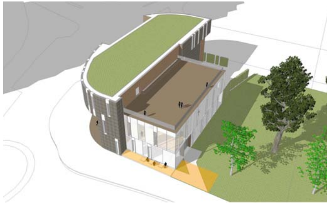
Moriyama & Teshima Architects March Schaffel Architects in Association

It was February 19, 1988 when Meewasin first moved into the old Rothman's building now the Meewasin Valley Centre with the goal to provide tourists and residents to Saskatoon with opportunities to learn about Saskatoon's history, the South Saskatchewan River and the future of the Meewasin Valley. The building has served well but is tired. More than ever Meewasin needs to continue to be the heart of the Meewasin Valley interpreting the cultural and natural story of past, present and future Saskatoon, adding the concepts of climate change, sustainability, water issues, developing a better understanding for residents and tourists so that they will become stewards of the entire Saskatchewan River Basin.